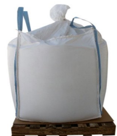
3000 or 4000 lb Bag