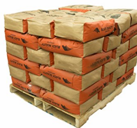
3000 lb Pallet